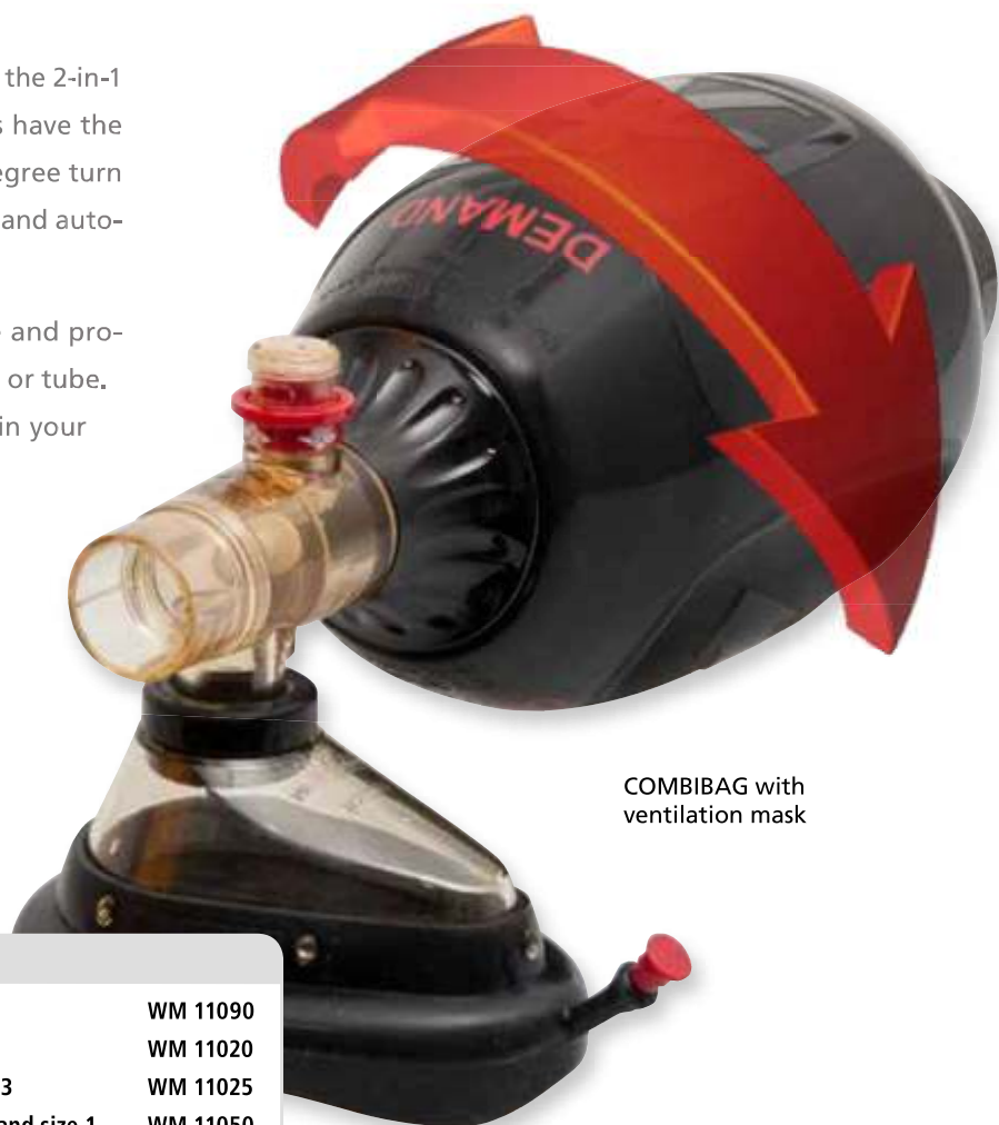
COMBIBAG with ventilation mask

The safety valve limits the ventilation pressure and protects the patient during ventilation with a mask or tube. With COMBIBAG you save time, free up space in your emergency case and save on costs.