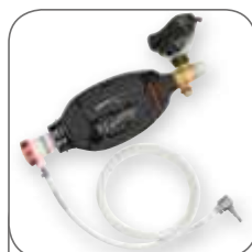
Connection fits oxygen reservoir or OXYMAND demand valve