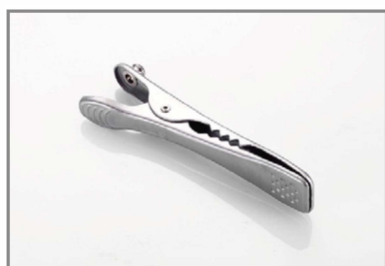
ECG: ECG crocodile clips will prevent falling and ensure signal stability