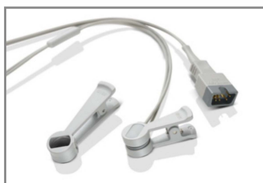
SpO 2 : Clips for animal tongue and ear