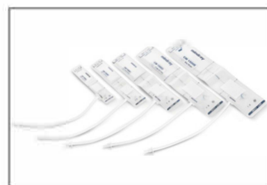
NIBP: Multi-size cuffs for different animals