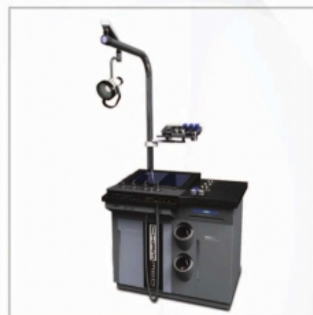
▲ CU-3000 B type(Black)