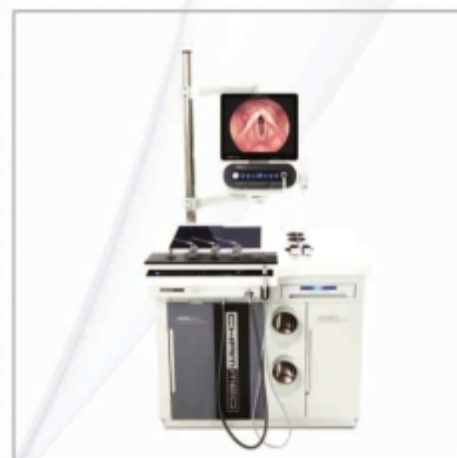
▲ CU-3000 B type(White)