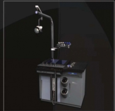
▲ CU-3000 B type(Black)