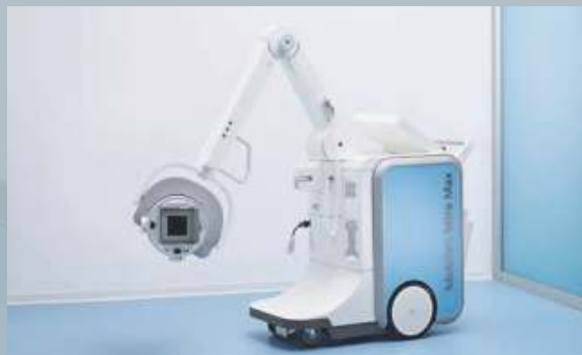
Fast lateral positioning