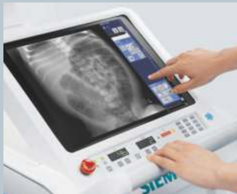
Crystal-clear image quality

See more in every image. DiamondView Plus improves image contrast and detail for outstanding image quality. It enhances bone detail and soft tissue contrast without increasing the dose. The automatic image processing solution can also be easily customized to the viewing preferences of your hospital.