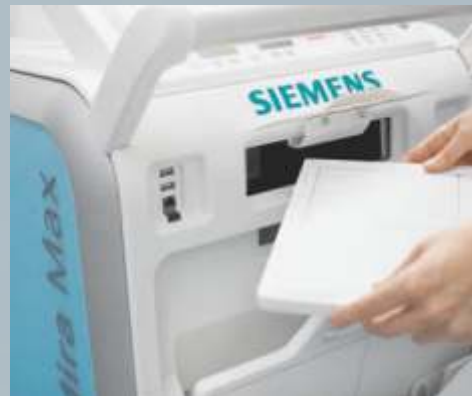
Infrared sensor for fast and easy detector swapping