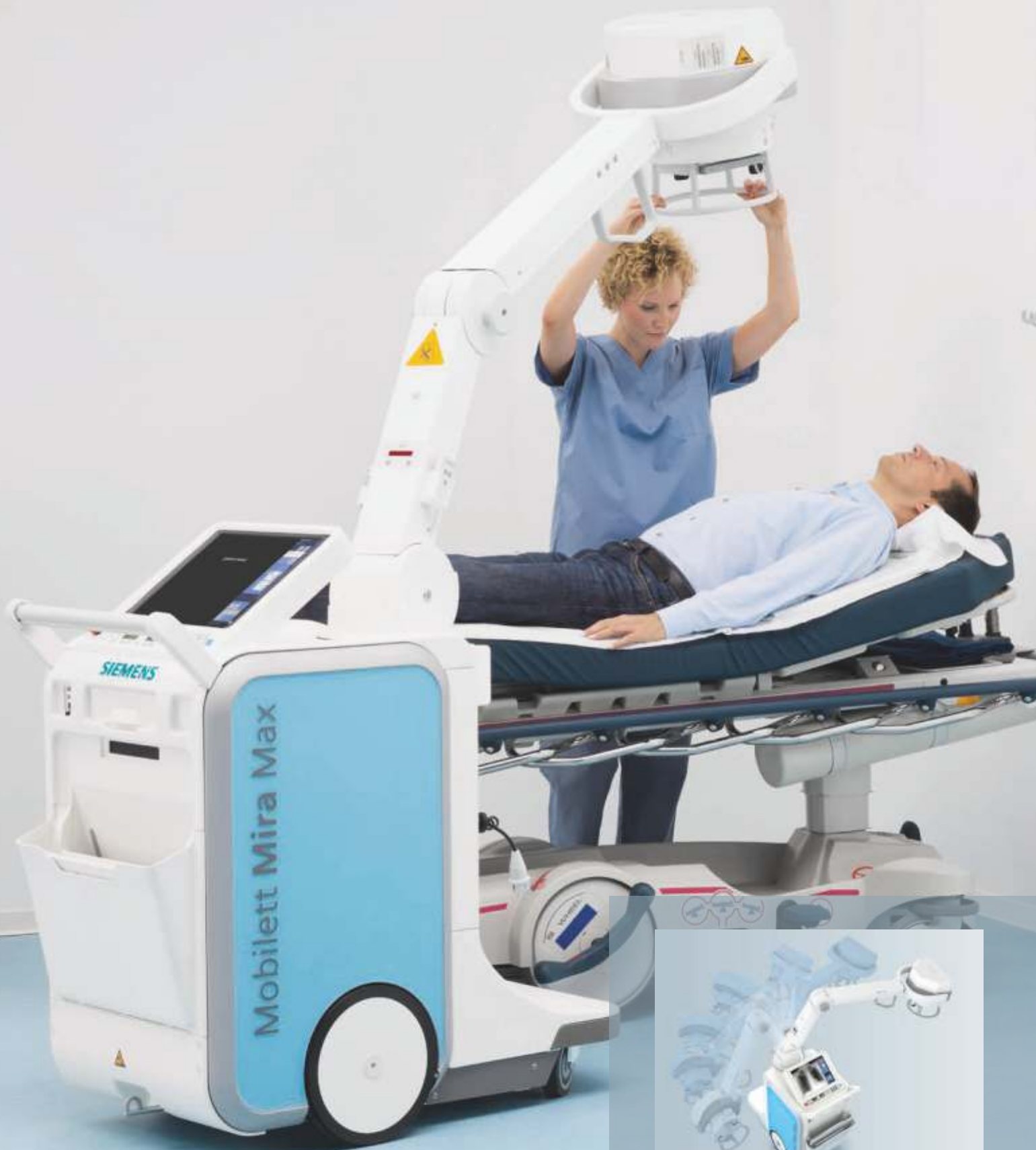
MAXreach rotates 180 degrees