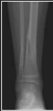
Without DiamondView Plus