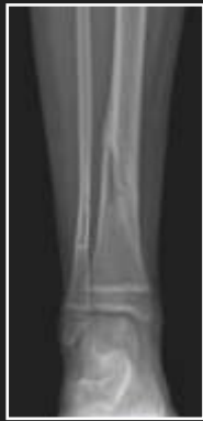
With DiamondView Plus