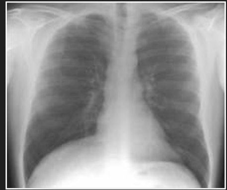
Without DiamondView Plus