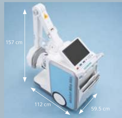
Mobilett Mira Max, lightweight and compact