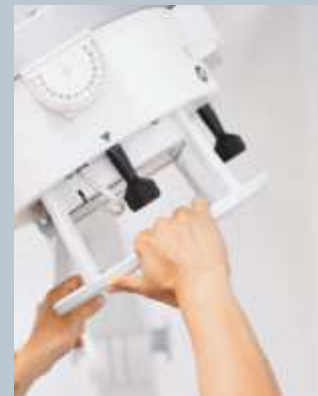
Fast and easy positioning