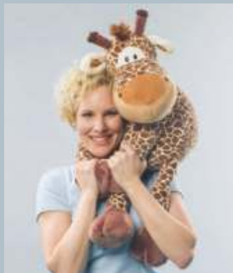
Right at your side