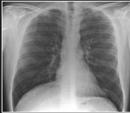
With DiamondView Plus