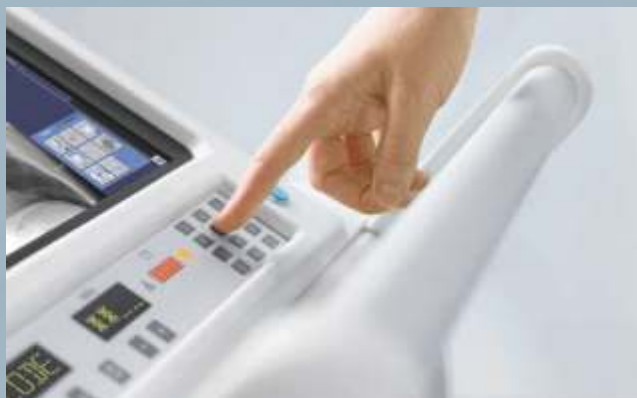
Numeric keypad* for easy system access