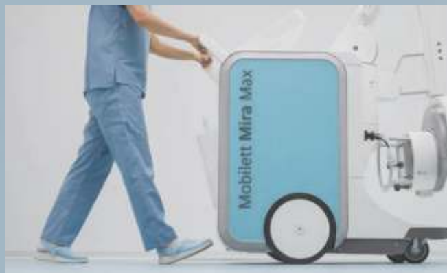
Ergonomic drive handle and large foot space for easy travelling