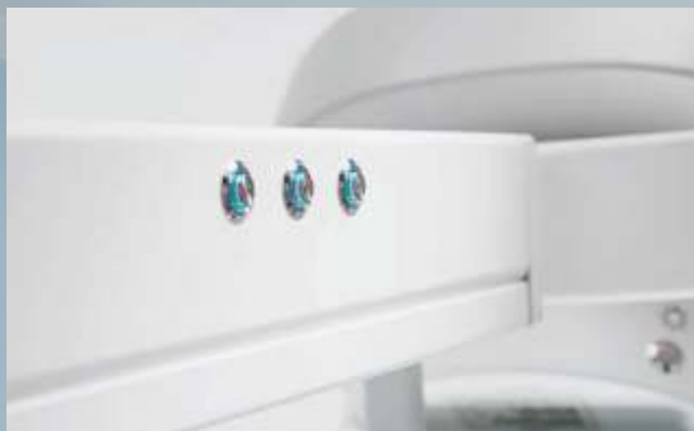
Precise system positioning at the push of a button

All of Mobelett Mira Max's cabling runs inside the tube arm. This means that it doesn't interfere with other equipment around the patient's bed, and also allows easy and hygienic cleaning and disinfection.