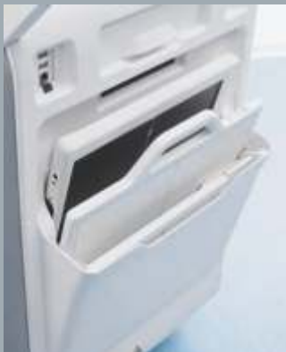
MAX wi-D and MAX mini detector – always at hand