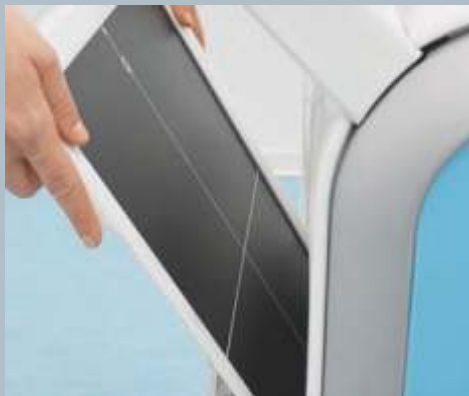
Safely store detectors and grid