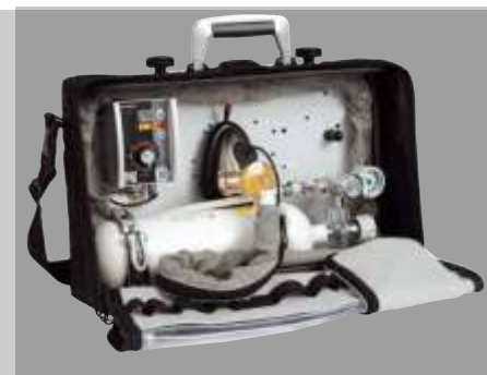
LIFE-BASE III with MEDUMAT Easy CPR (WM 9155)