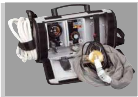
LIFE-BASE light With MEDUMAT Easy CPR and MODUL CPAP (WM 28235)