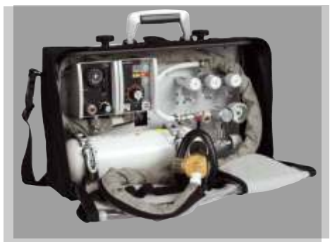
LIFE-BASE III MCI with MEDUMAT Easy CPR, MODUL Oxygen and 3-way distributor (WM 8000)