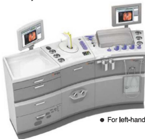
● For left-hander