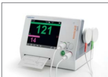
TEAM3 - I/P

Antepartum and Intrapartum models available in singleton, twins or triplet configuration. Available with maternal vital signs and integral battery options.