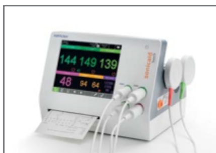
TEAM3 - A/P

TREND intrapartum function provides clear data on periodic changes over time in the FHR. For use during the first stage of labour. Trending of baseline, STV and deceleration data provides an aid to labour trace interpretation.