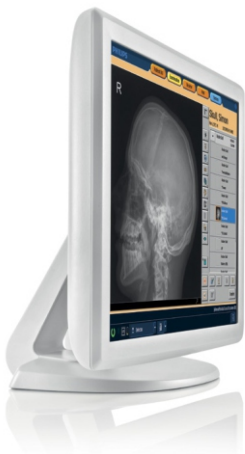
Eleva promotes seamless workflow across different Philips modalities