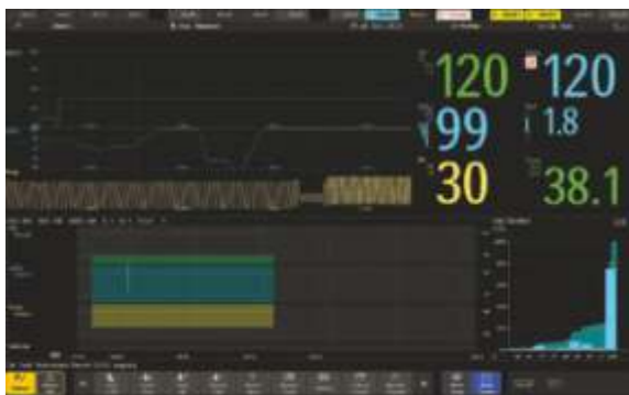
Car seat testing, recommended by the American Academy of Pediatrics, helps clinicians to assess neonates' ability to safely tolerate the car trip home.