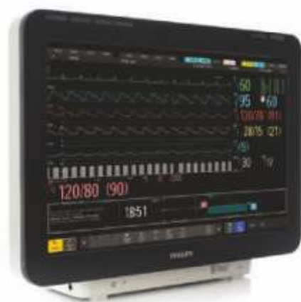
Philips IntelliVue MX800 features a 19" panoramic touchscreen and can also be operated by remote control.

IntelliVue MX600, MX700, and MX800 bedside patient monitors