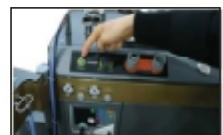
Suction hose rinsing system