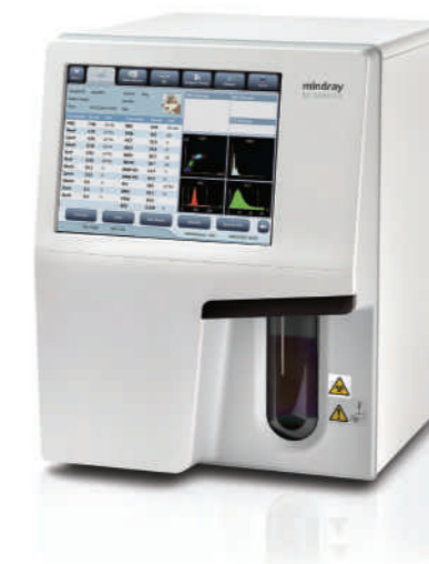
BC-5000 Vet Auto Hematology Analyzer