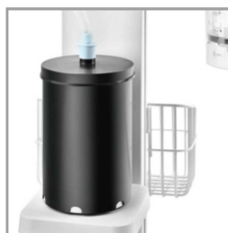
Gas filter canister