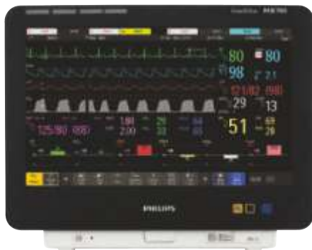
Philips IntelliVue MX700 offers a wide 15" touchscreen, and can also be operated by Navigation Point control or remote control.