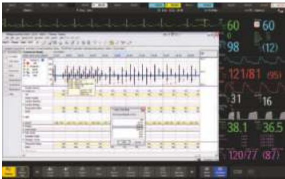
Show patient flow sheet from critical care information system (IntelliSpace Critical Care and Anesthesia (ICCA)).