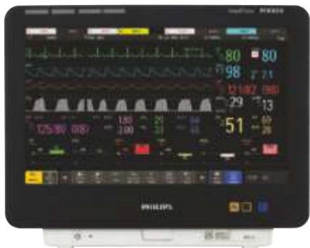
Philips IntelliVue MX600 has a 15" widescreen with Navigation Point control, and can also be operated by remote control.

Protecting investments IntelliVue MX patient monitors offer leading-edge technology to protect your investment, and are easily upgradeable to adapt to your changing needs. From the start they work to simplify clinical workflow and allow easy access to relevant patient information from various hospital applications and systems.