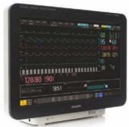
Philips IntelliVue MX800 features a 19" panoramic touchscreen and can also be operated by remote control.

IntelliVue MX600, MX700, and MX800 bedside patient monitors