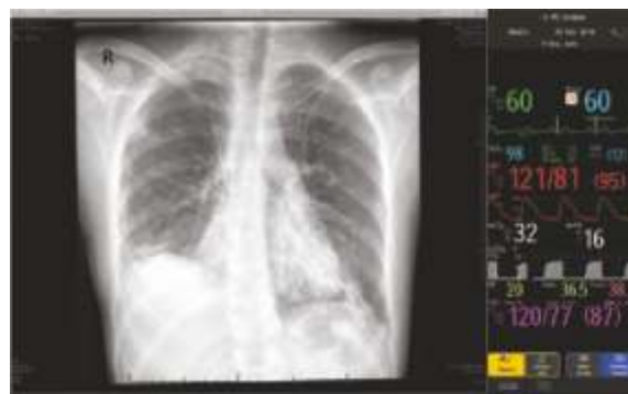
Leverage relevant information from your PACS.