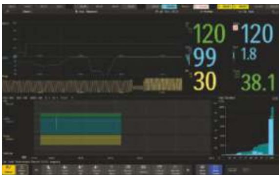
Car seat testing, recommended by the American Academy of Pediatrics, helps clinicians to assess neonates' ability to safely tolerate the car trip home.