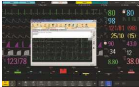
Access previous ECGs from IntelliSpace ECG Management System (iECG) or other ECG management systems.