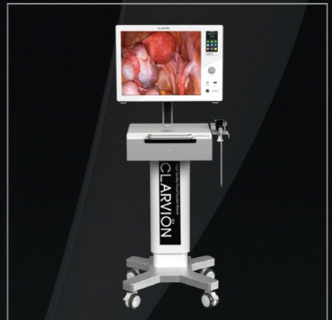
▲ QVION19 Cart type