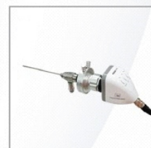
▲ SD Camera