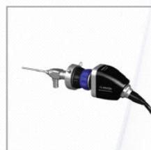
▲ HD/Full HD Camera