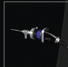
▲ HD/Full HD Camera