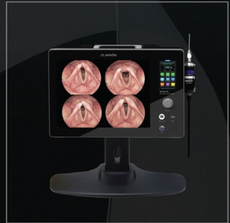
▲ QVION15 Monitor stand type