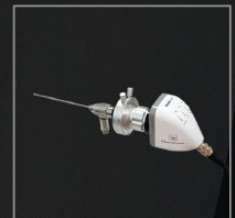
▲ SD Camera