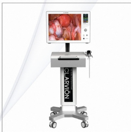
▲ QVION19 Cart type