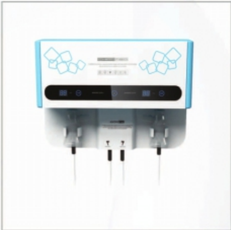
▲ XCN5 extreme