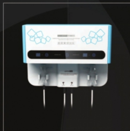
▲ XCN5 extreme