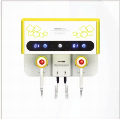
▲ XCS5 extreme